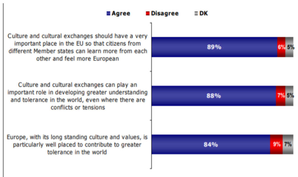
Fig. 2. Agreement with statements on cultural Exchange — % EU27 [4]

One of the main components of achieving professional development in Poland is for students to take part in exchange programs. Why is this issue so important? In order to be competitive in modern societies, students from all the EU countries have to spend at least one semester as an Erasmus student in order to practice English and to enrich cultural background while building relationships with the students from other countries. Cultural exchange is seen as fostering greater tolerance, learning and understanding, in both European countries and the world. As it can be concluded from the chart below, respectively, 89%, 88% and 84% of the participants agree with the statement that cultural exchange is highly needed in modern society.