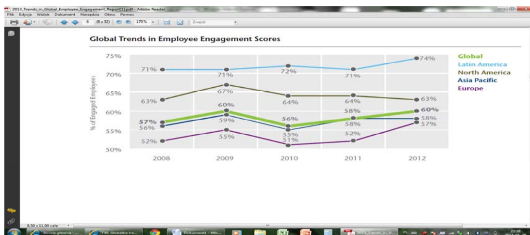
Figure 1: Global Trends in Employee Engagement Scores